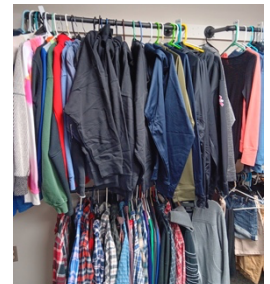
Washougal School District Principal's Checkbook

Helps Washougal school principals provide assistance for low income or homeless students. An Adult Transition Program to train students with disabilities for appropriate work placement. Shoes, clothes, hygiene products and food for Panther Den . A mobile laptop cart for families without access to technology and internet services.