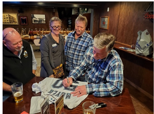
CWCC Fundraiser with Mariners's pitcher Jamie Moyer at the Washougal Times Restaurant & Lounge