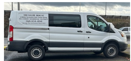
IFTH Cargo Van