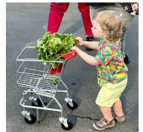
Camas Farmers Market