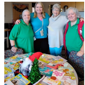
General Federation of Women's Clubs

Help fund the construction of a pavilion for the use by residents receiving end-of-life care. Having an onsite, outdoor facility will open the joys of nature (birds, animals, trees, flowers, sun and fresh air) to the residents.