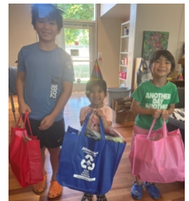
Camas School Supply Recipients

Help fund 10 free events in the Camas and Washougal for children aged 0 to 12, fostering access to high quality, educational, equitable play experiences, ensuring all children have a chance to thrive through the power of play.